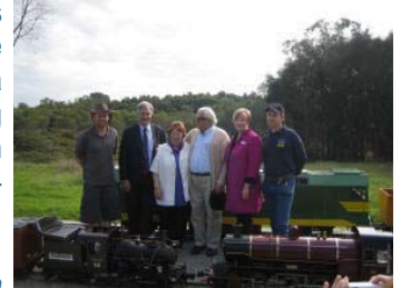
Stakeholders at the launch of Castledare Miniature Railway Extension

received $68,200 to upgrade and expand passenger boarding facilities and landscaping of the Castledare Miniature Railway including the enlargement of the existing platform area at Wilson Park, provision of a covered shelter over the railway lines, installation of an additional passing line and building of a ticket box and connection to services. Partners in the project are Challenger TAFE, Wilson Wetlands and Castledare Miniature Railway.