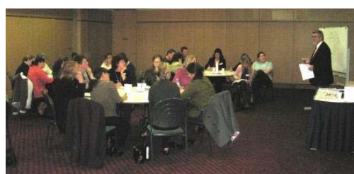
Participants at the Cockburn, Mandurah and Wanneroo Workshops