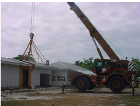
Works being carried out for the Community Resource Centre at Cocos (Keeling) Island

A complete list of approved Regional Partnerships projects in the metropolitan area can be found at: www.perthacc.com.au and follow the link to Project Profiles.